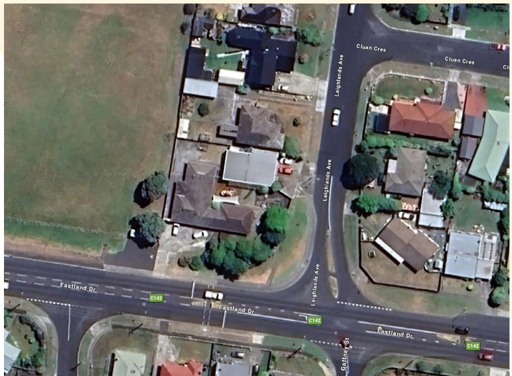
Aerial view of site.