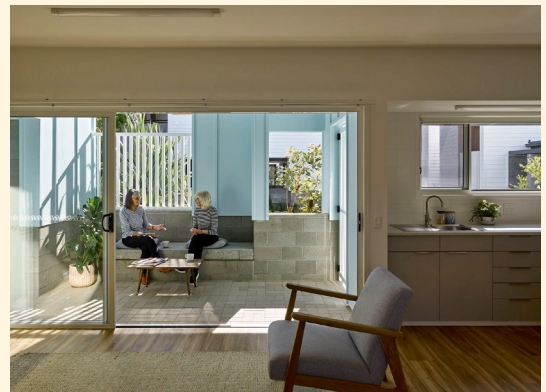
Project precedent photos representative of the future built environments of Stage 1a.